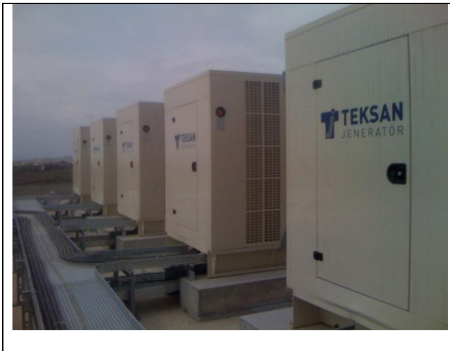
2x700 KVA + 3x500 KVA Synchronised Generators